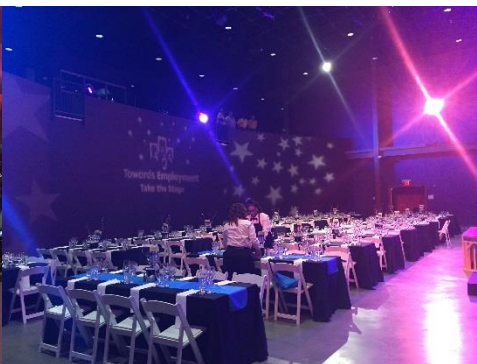
Towards Employment 10 th Annual Benefit