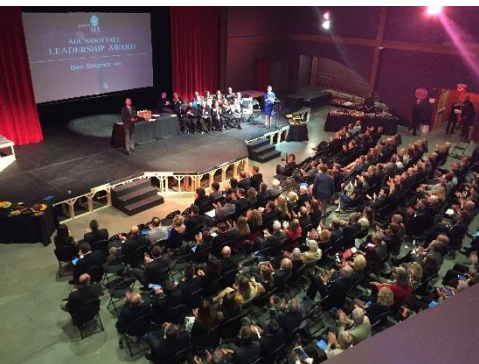
AIA Design Awards